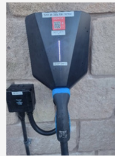
Example of QR code on EV charger